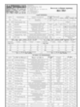
Price List & Order Form (85k)

Adobe Acrobat Reader is required to view these datasheets (available free from the Adobe website .)