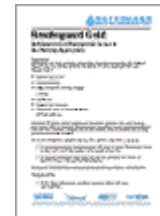
Renderguard Gold (64k)