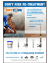
Benefits to householder leaflet (230k)