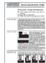
Vandex Injection Mortar (52k)