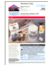
BBA Certificate - Damp-proofing (362k)