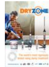
Dryzone datasheet (2.7Mb)