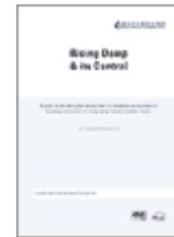
Rising damp & its control (256k)