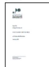
DPC Cream Test Report (1.2Mb)